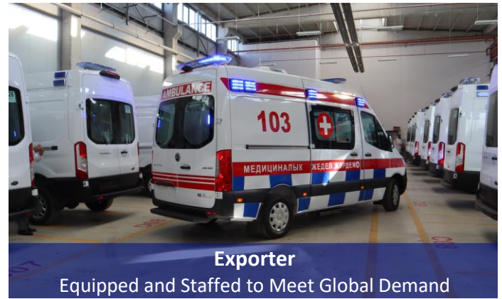
Exporter Equipped and Staffed to Meet Global Demand

AC ARGE Endüstriyel Üretim Sanayi ve Ticaret A.Ş.