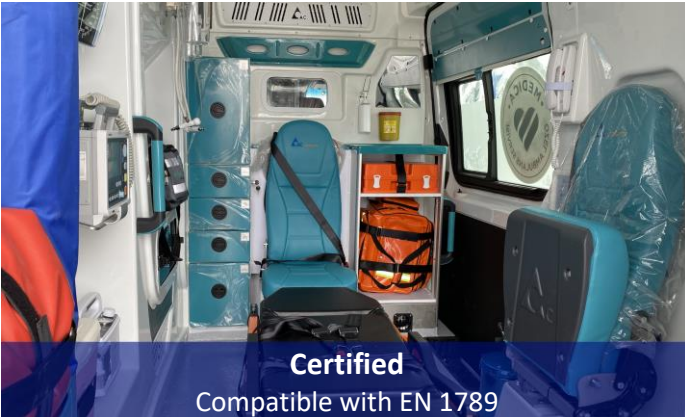
Certified Compatible with EN 1789