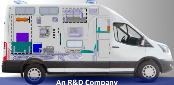
An R&D Company Ambulance Design and Engineering