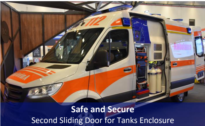
Safe and Secure Second Sliding Door for Tanks Enclosure