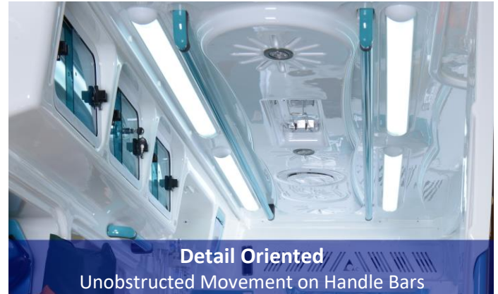
Detail Oriented Unobstructed Movement on Handle Bars