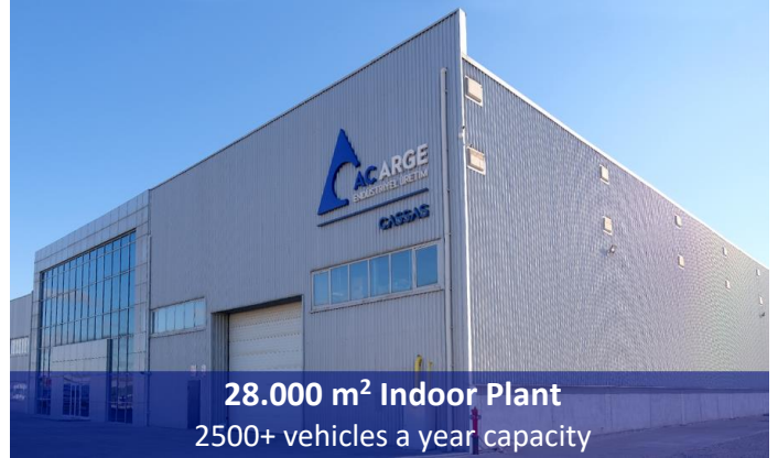
28.000 m 2 Indoor Plant 2500+ vehicles a year capacity