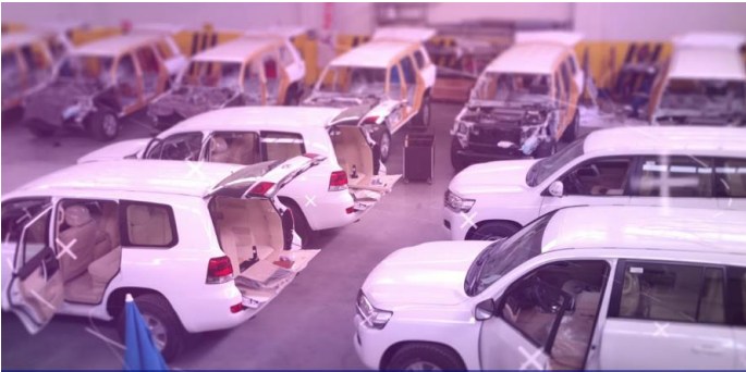
Multi-Sectoral Solutions for Health and Defense Sectors