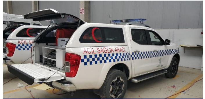
First Responders Customized First Responder Vehicles